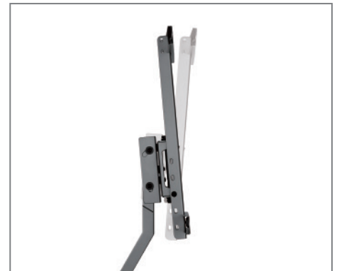
+5 / -10° tiltable