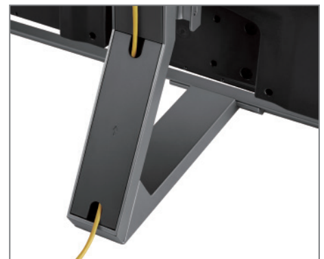
incl. cable routing